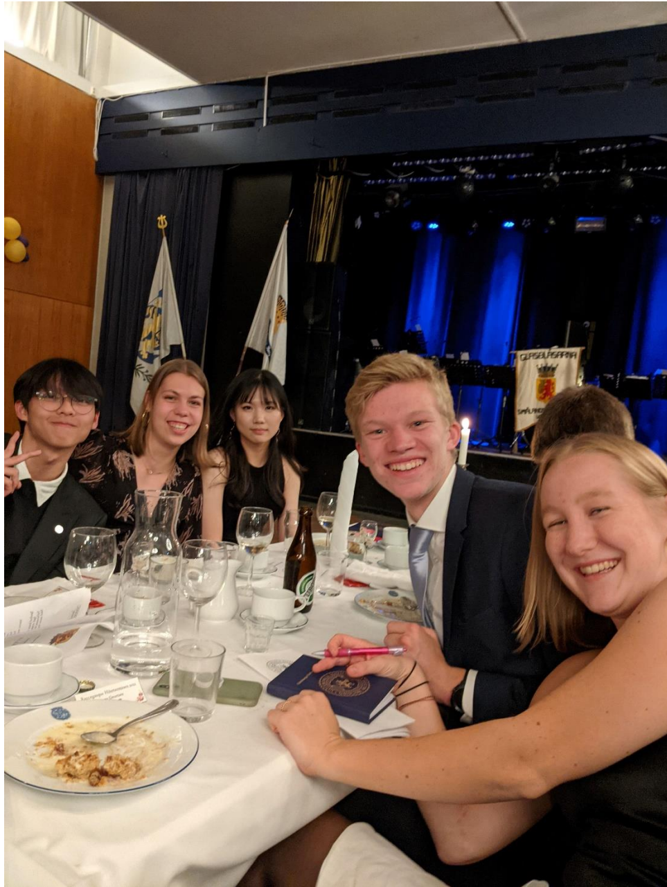
(gasque with my friends in Goteborg nation)

For the study, I had one lecture and one seminar to participate for first five weeks. Seminars were mandatory as it counted towards to your score. It was my first time to work with four foreigners and they were all Swedish. It was interesting to try new style of works. The course required one group work with around 2500 words every week and it was a case study. It was not a difficult work, but you have to take reference from the reading materials.